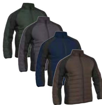
Art. 26.707.1 | EJ4131 NARES PUFFER SOFTSHELL JACKET Page 28