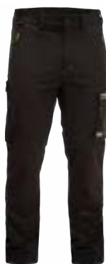
Art. 28.105.1 | EPC4202 SKILL 4D TRS STRETCH WAISTBAND PANTS Page 38