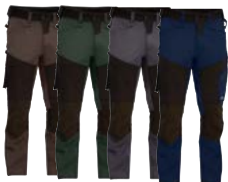
Art. 28.106.1 | EPC4201 CONCEPT STRETCH WORK PANTS Page 38