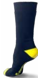
Art. 24.041.0 | ESX7210 BISLEY WORKWEAR SOCKS Page 46