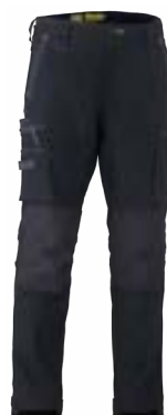
Art. 28.616.0 | EPC6333 STRETCH CARGO PANTS WITH KNEE PAD POCKETS Page 41