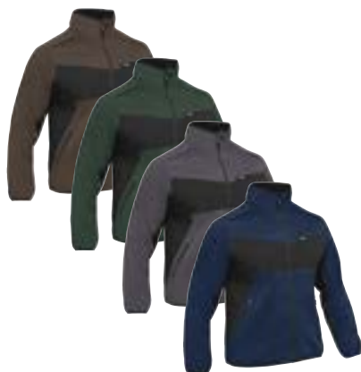
Art. 26.433.1 | EJ4330 CONCEPT KNIT JACKET Page 29