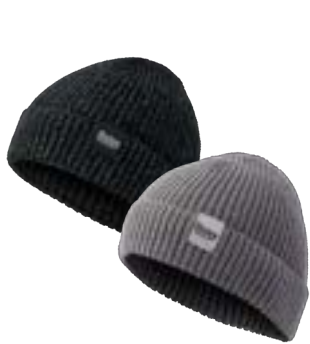
Art. 25.527.1 | EA5271 CLAY KNITTED HAT Page 44

We have specialized in the development of durable and hard-wearing clothing for over 60 years.