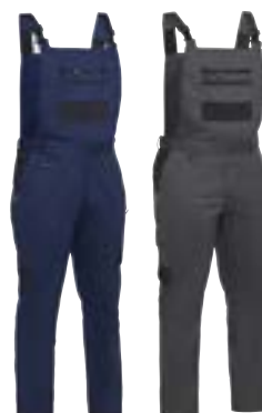
Art. 28.114.0 | EBB0112 OLIVER TWO-TONE OVERALL Page 43