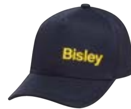
Art. 25.443.0 | ECAP50 BISLEY CAP Page 45