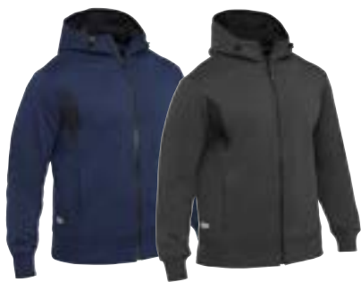
Art. 26.414.0 | EK4154 RAWSON TWO-TONE FLEECE HOODIE WITH ZIPPER Page 26