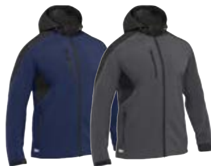
Art. 26.473.0 | EJ4191 HICKS SOFTSHELL-JACKE Page 27