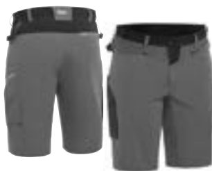
Art. 28.108.1 | ESHC2107 CONCEPT LIGHT STRETCH SHORTS Page 39