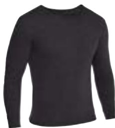
Art. 26.947.1 | EK9470 THERMO UNDERWEAR Page 47