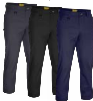
Art. 28.109.0 | EPC4008 MECHANICAL STRETCH CARGO PANTS Page 41