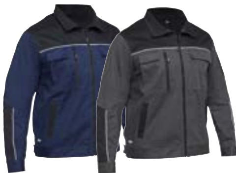
Art. 28.618.0 | EJ4600 OLIVER TWO-TONE JACKET Page 28