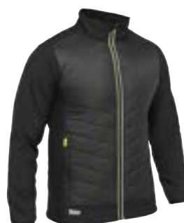
Art. 26.704.1 | EJ4126 COOPER PUFFER SOFTSHELL JACKET Page 29