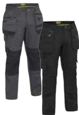
Art. 28.112.0 | EPC4114 OLIVER TWO-TONE CRAFTSMAN CARGO PANTS Page 42