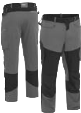
Art. 28.107.1 | EPC4107 CONCEPT LIGHTWEIGHT STRETCH PANTS Page 39