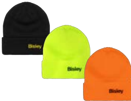
Art. 25.528.0 | EBEAN55 BISLEY BEANIE Page 44