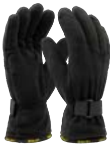
Art. 25.066.1 | EA0661 ICEBREAKER MICROFLEECE GLOVES Page 45