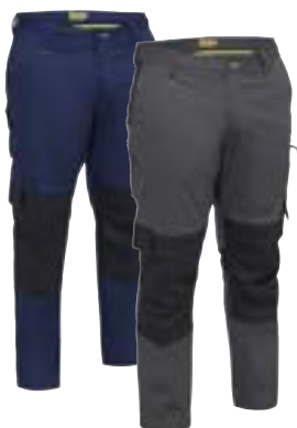
Art. 28.111.0 | EPC4111 OLIVER TWO-TONE CRAFTSMAN CARGO PANTS WITH ZIP POCKETS Page 42