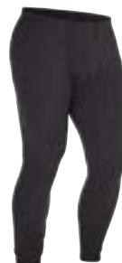
Art. 26.948.1 | EPK9480 THERMO PANTS Page 47